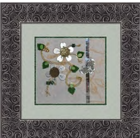
Wall Art ivy and butterfly framed silver