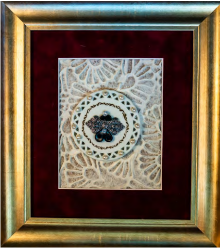
Wall art PORCELAIN, PEARLS, Heritage bow and quilling FRAMED Mixed Media June-6