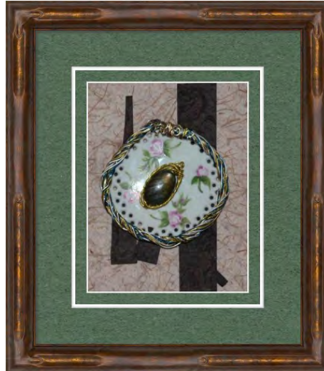
Wall art w Labordite and porcelain painted roses and wire wrap FRAMED